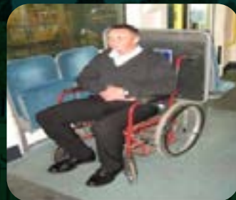
Diagram 1 Wheelchair positioned correctly in bay