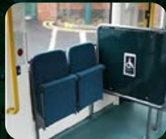
Diagram 1 Wheelchair and Pushchair Bay