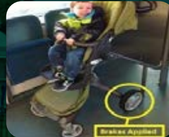
Diagram 3 Pushchair positioned correctly in bay