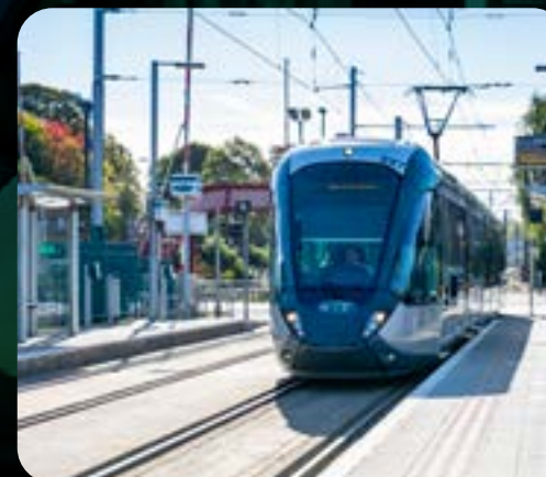
NET tram stop